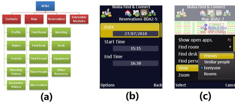
Figure 1. (a) Functional architecture of Nokia Find & Connect which is currently split into three main functions: Contacts, Map, and Reservation. (b) Make a new reservation in NF&C. (c) View different kinds of people or resource nearby (Friends, Similar people, Everyone and Rooms)